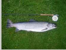
11lb Sea Trout caught during May

The Water of Fleet has long been a renowned sea trout river although recent catches have decreased. Today most fishing is available on the lower Main Water of Fleet up to the Big and Little Water confluence. Each beat is well maintained with bank protection and cutting undertaken for the benefit of anglers.