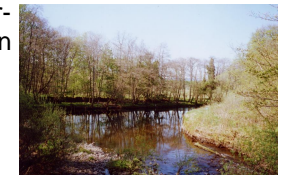
The Bridge Pool

Rusko Holidays have fishing at the Banks Pool and Barbara Pool which lie between and below Cally Estates upper river beats 3 and 4. These pools can be fished for around £20 per day for a maximum of 2 rods fishing any one beat. Contact Rusko Holidays for further details on 01557 814 215.